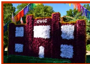
The CVIC Hall takes to the road for the Carson Valley Days parade

Greetings from the Town of Minden Administrative Office and Happy Summer! As our Chairman mentioned, I too hope you enjoyed the Carson Valley Days festivities. Many entities should be recognized for their contributions to the Breakfast in Minden Park, including Model Dairy, the Carson Valley Inn, and the 20/30 Club. In addition, I'd like to take this opportunity to thank our Minden Staff for their hard work in making it all happen. This is a shining example of Minden Spirit in action and I was honored to be a part of it. Stay tuned for future events including the 4 th of July and October CVIC Hall Centennial Celebration.