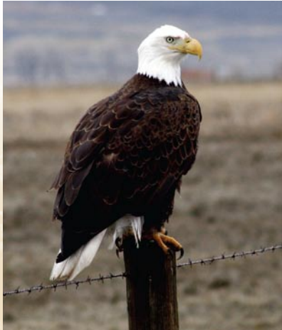
A watchful bald eagle gazes from its perch on a Minden cattle ranch's fencepost. Eagles and other raptors descend on valley ranch lands during the calving season to feast on the nutrient-rich afterbirth.