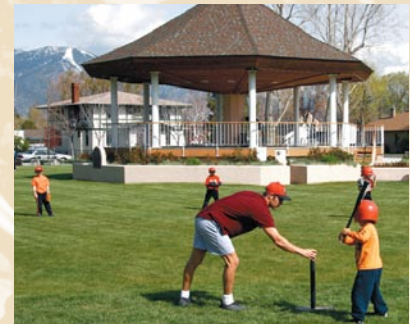
Youths of all ages enjoy a variety of sporting and recreational activities in the well-maintained local parks.

The Town of Minden incorporates parks and open spaces in each phase of growth. Minden Park, located in the heart of town, and neighborhood parks offer residents opportunities to attend special events, have picnics, swing and slide, or just enjoy a peaceful moment with family and friends.