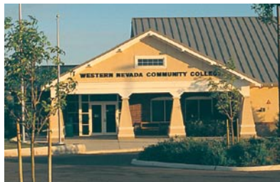
Situated in east Minden, the Douglas Campus of Western Nevada Community College offers 50 academic degrees and certificates. It also hosts a University of Nevada, Reno MBA program.

The University of Nevada, Reno, through its College of Business Administration, has developed an MBA program at the Douglas County WNCC campus. The mission of the university’s MBA program is to prepare men and women to be general managers, executives, and leaders in our changing business environment.