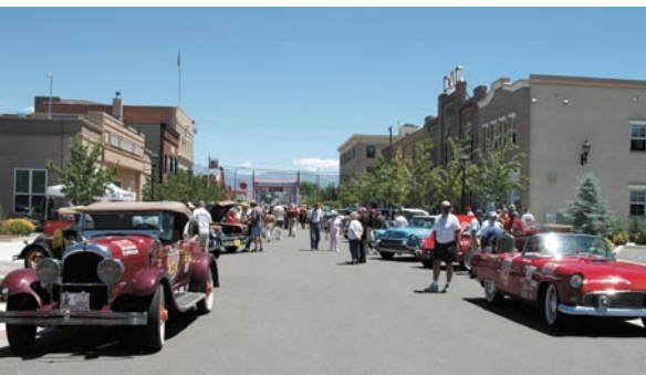
Excitement fills the air during the 2006 Spirit of Americana National Guard Great Race. Many events and celebrations are held in historic downtown Minden.

Music concerts held in Minden Park on balmy summer evenings offer residents and visitors the opportunity to enjoy live performances by popular musicians and bands while picnicking and socializing. During the holiday season, the Christmas tree lighting at the park attracts locals and visitors alike. The celebration of the country's birthday every Fourth of July is another popular event in this community and at Minden Park.