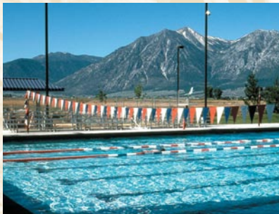
Spectacular mountain views make outdoor swimming at the Carson Valley Swim Center even more enjoyable. The outdoor pool is one of several, including an Olympic-size indoor pool.